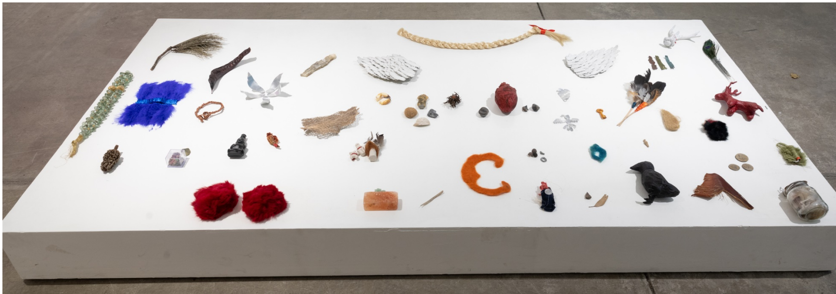
Gordana Žikić, Red Deer Altar , 2018 Mixed media Sizes vary