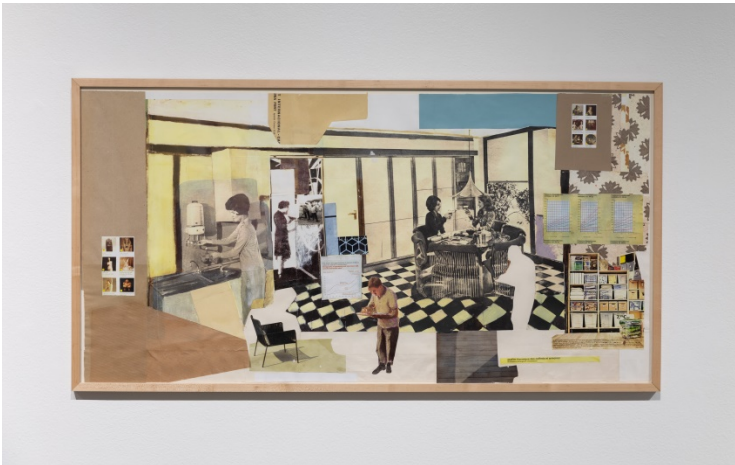
Šejma Fere, Order of Things (Coffee two) , 2016

Artists are listed in alphabetical order by last name according to the English alphabet.