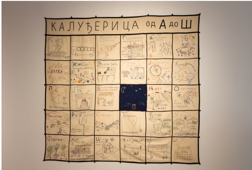
Documentary Embroidery Office Kaludjerica from A to Ш , 2010 Embroidered tapestry 6' x 6' (182 cm x 182 cm)