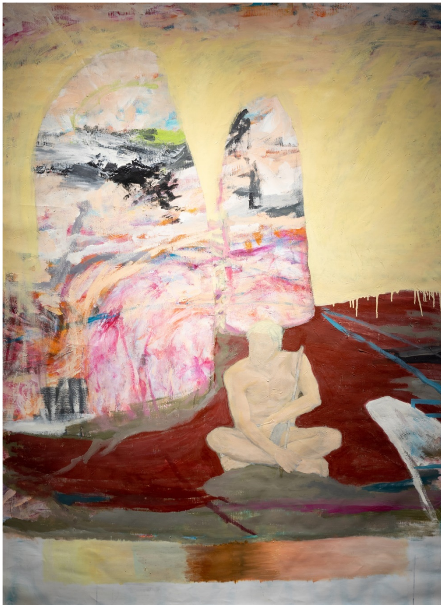
Simonida Rajčević, Strange Waves 11 , 2016