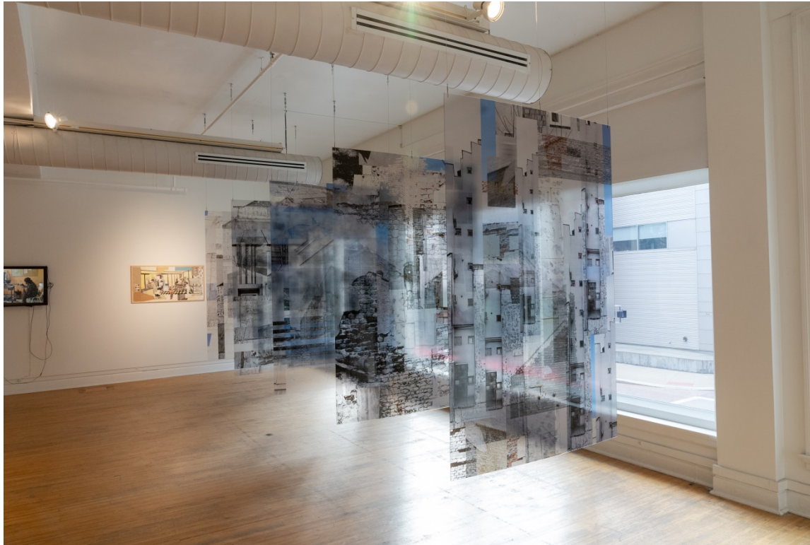
Nina Todorović, Pattern Recognition (Deconstruction) I – V , 2017 Five digital prints on acrylic 48" x 71" (120 cm x 180 cm)