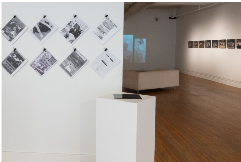
Vahida Ramujkić Disputed Histories , 2006 – ongoing Eight 8 ½" x 11" booklets; puzzle of Yugoslavia