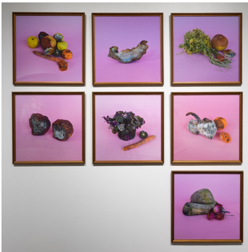
Tijana Radenković, Perfect time , 2017 Seven photographs on paper 19.6" x 19.6" (50 cm x 50 cm)