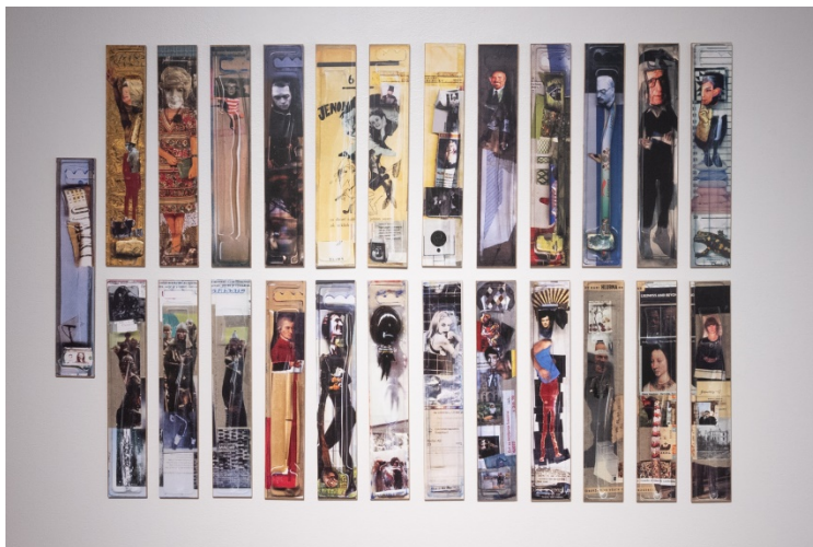
Šejma Fere, Toothbrushes , 2005 – 2020 Twenty-five digital prints on wood planks 3.1" x 17.7" (8 cm x 45 cm)