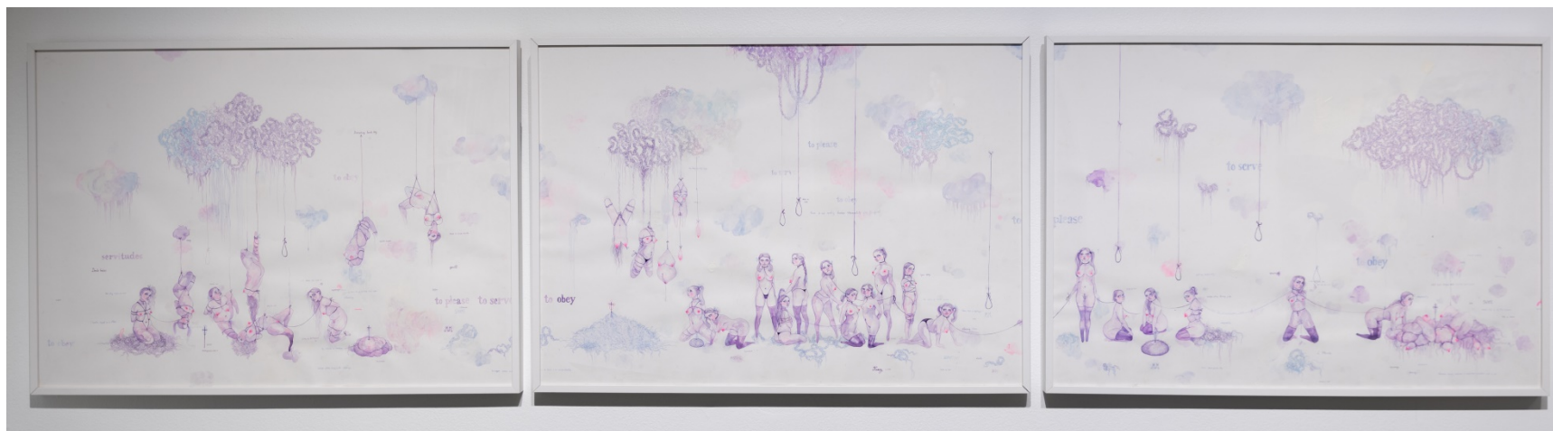
Marina Marković, To please, serve, and obey , 2020 Three ink drawings on paper 27" x 118" (68.5 cm x 299 cm)