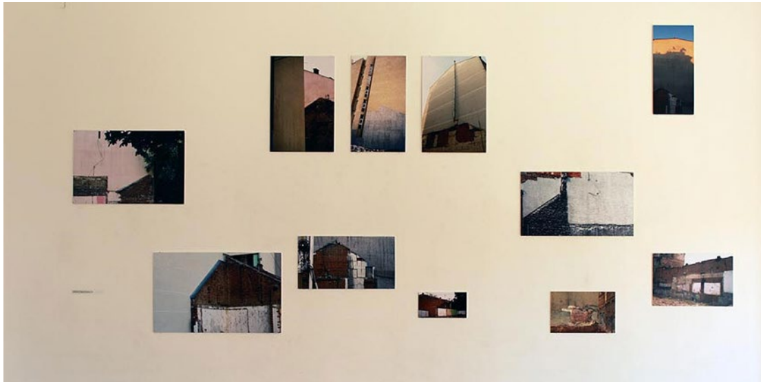
Nina Todorović, Architecture of Memory , 2010 – 2013 Thirty-three digital prints Sizes vary